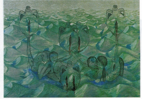
Will Francesco Clemente's "untitled" give the Miami Museum of Art what it needs?