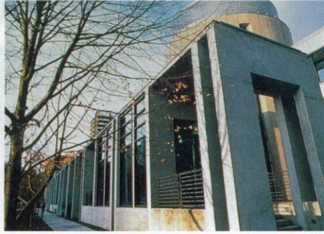
Is the Frye Art Museum's industrial facade enough?